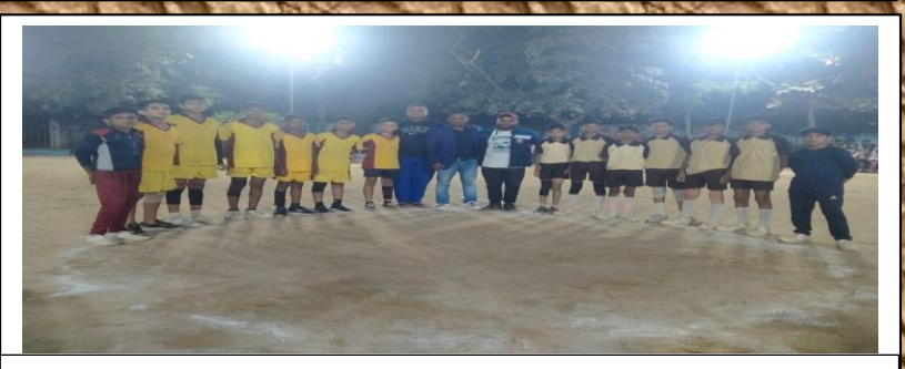
67 SGFI State Level Handball Competition 2023 was held at Narmadapuram M.P