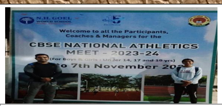
CBSE Atheletics National Championship 2023 was held at Raipur