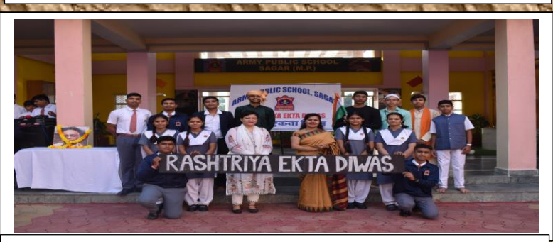
Special assembly conducted by Class 10 on the occasion of 'Rashtriya Ekta Diwas (National Unity Day)'