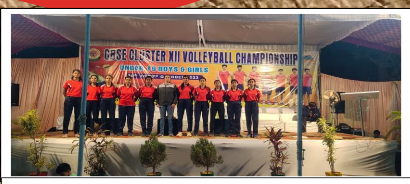
CBSE Cluster XII Volleyball Championship 2023-24 at Shivpuri