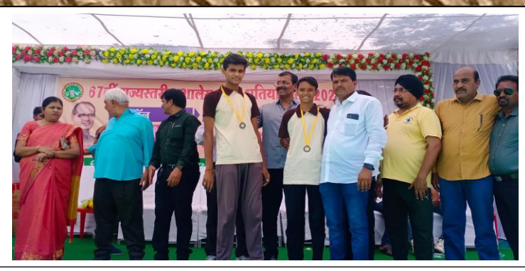
67 SGFI State Level Golf Competition was held at Indore (M.P)