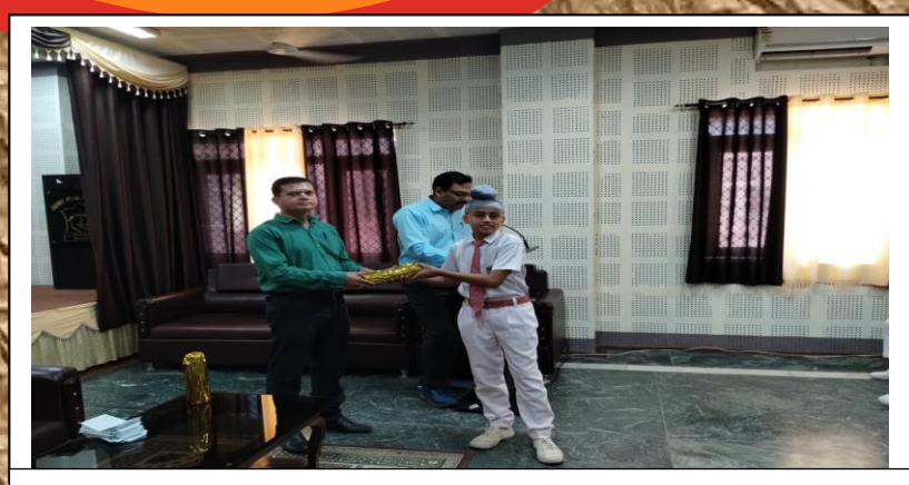
Postal week celebration under which various competition was held by Postal Department, Sagar and the students were felicitated