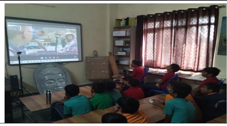
24th Tennis Volleyball championship was held at Jabalpur