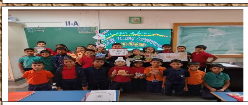
Story Telling Competition