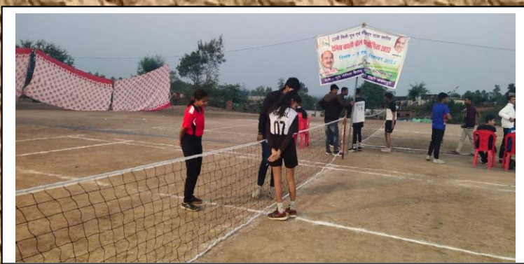
24th Tennis Volleyball championship was held at Jabalpur