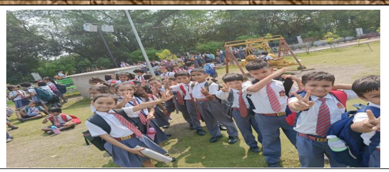
Educational Excursion was conducted for class 1 to Atal Park