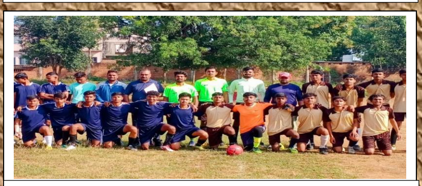
SGFI State Level Football U-17 Boys Category was held at Sidhi M.P