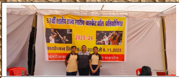
67<sup>th</sup> SGFI State Level Basketball Tournament held at Shahdol