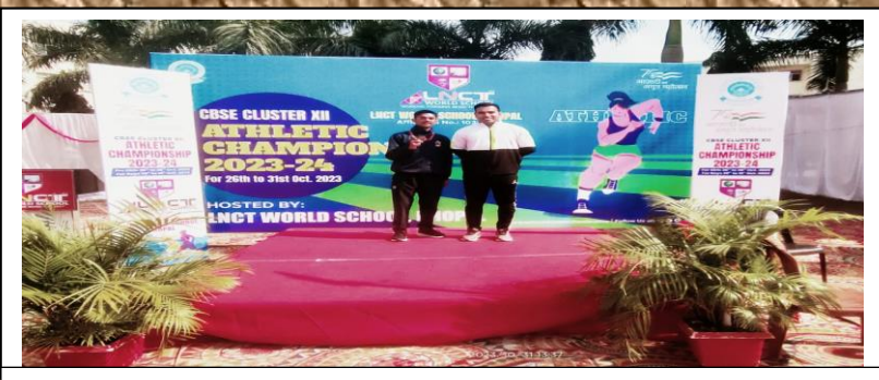
CBSE Cluster XII Atheletic Championship 2023 was held at Bhopal