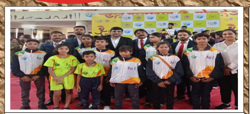
Khelo MP Youth Games State Level Yoga Competition