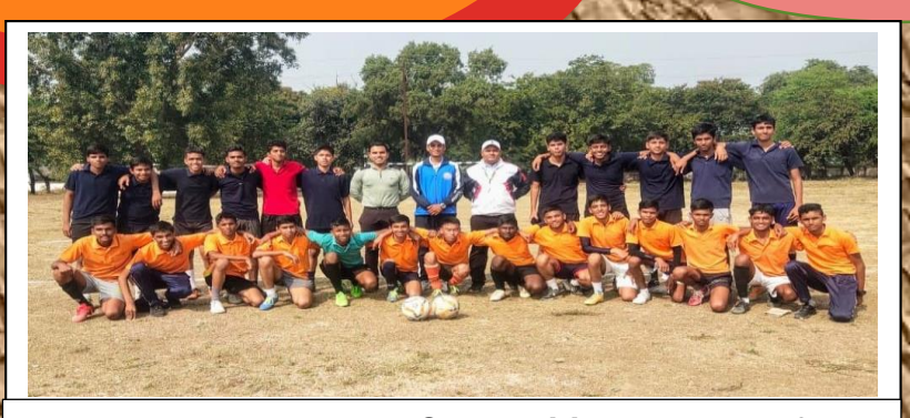
Inter House Football Competition was held for students of classes 9<sup>th</sup> to12th