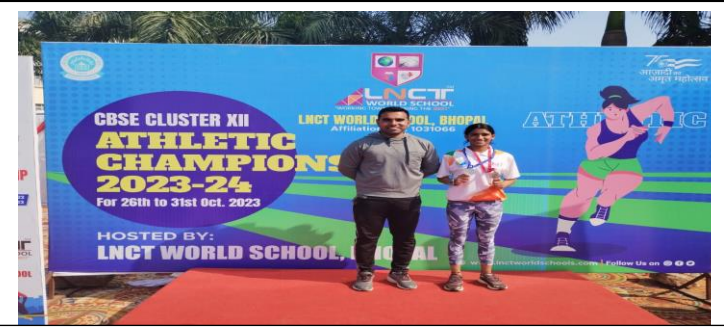
CBSE Cluster XII Atheletic Championship 2023 was held at Bhopal