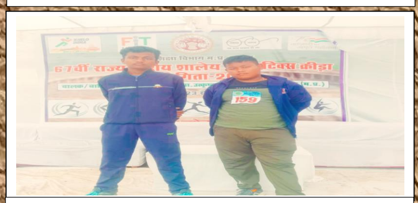
SGFI Athletics State Level Competition was held at Morena