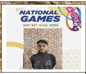
37th National Games 2023 at Goa in which students participated in the Mini Golf Championship 2023